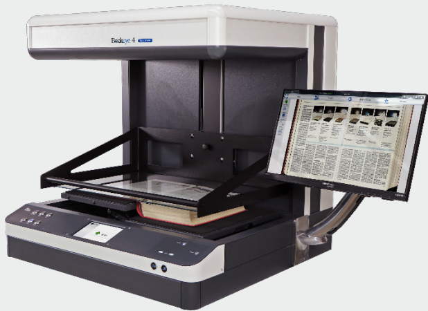
Horizontal self-adjusting book cradle with flat glass plate. Optional 22" touch screen

The motor driven V-shaped glass plate enables distortion free scans while it also protects the book binding. The balanced design allows effortless scanning without any physical effort. For exact positioning on the book fold, the V-shaped glass plate is moved horizontally. If required, the V-shaped glass plate can be removed without requiring any tools or special technical training.