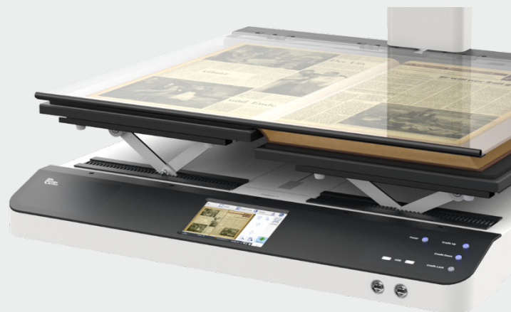
The motorized book cradles move to position the book against the glass plate.