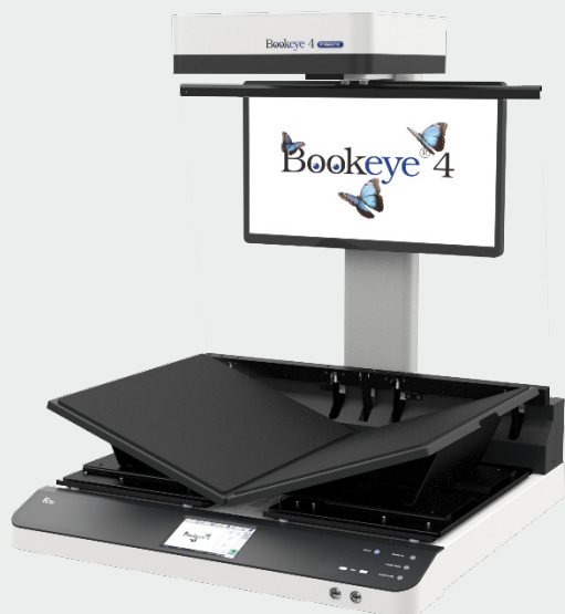
Scanning a book using the protective V cradle for fragile bound documents.

Bookeye® 4 V1A is suitable for digitization projects that require high quality and maximum productivity, even in 24/7 operation. Originals up to A1+, such as books, magazines, posters, folders or bound documents of all kinds, can be digitized by the Bookeye® 4 V1A at unsurpassed scanning speed.