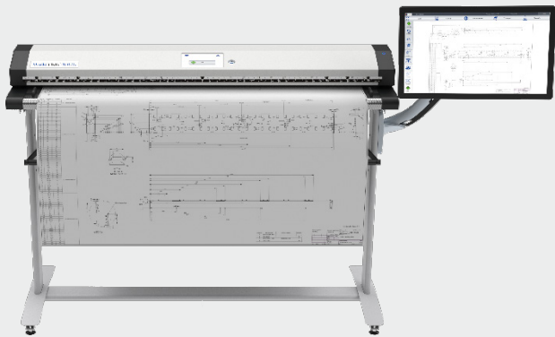
Large documents like maps rewind to the front or fall into the paper catch.

The WideTEK® 48CL produces extraordinarily sharp images, with color accuracy even superior to competing CCD scanners. Document rotation is done on the fly, a scan of an E-sized / A0 document in landscape at 300 dpi in 24bit color takes less than 7 seconds to scan and another 2 seconds to crop & deskew, preview and store.